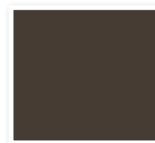
116 DARK BRONZE