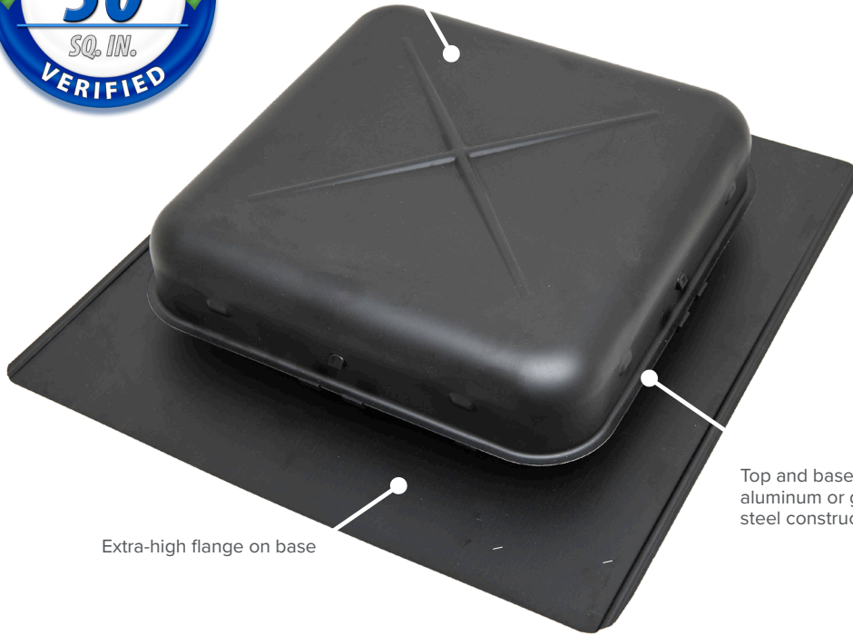
Extra-high flange on base